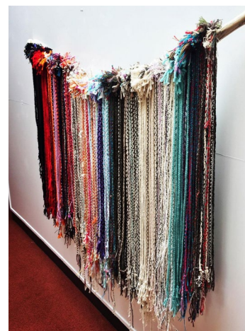
Just like a Braid

Paper, Cotton, Wool, Acrylic, Magnetic Tape, braided, on driftwood, 2016-2107, Brenda Petays